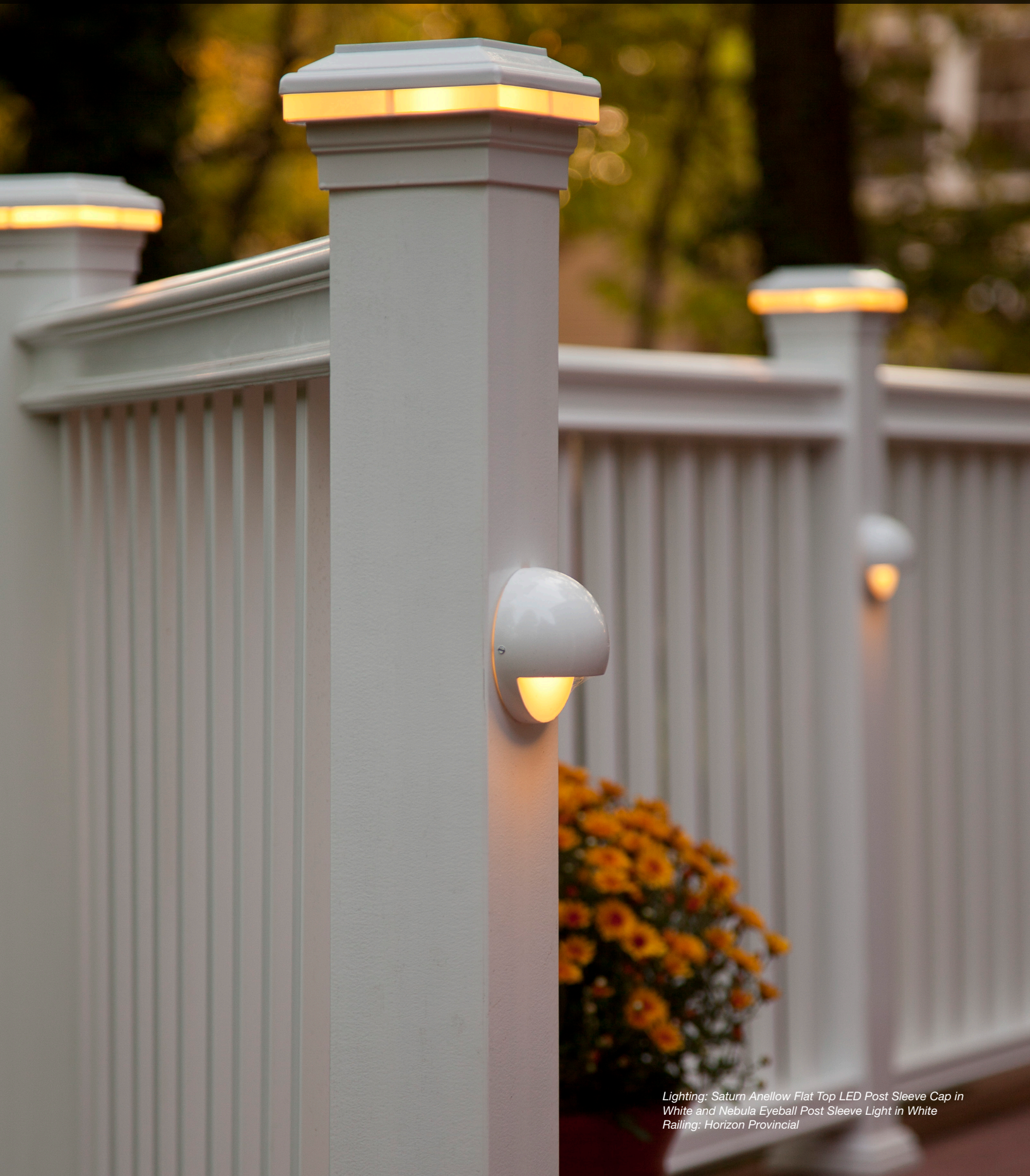
Lighting: Saturn Anellow Flat Top LED Post Sleeve Cap in White and Nebula Eyeball Post Sleeve Light in White Railing: Horizon Provincial